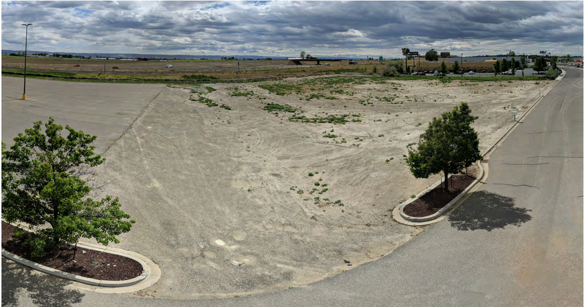
Looking Southwest from Picard Place