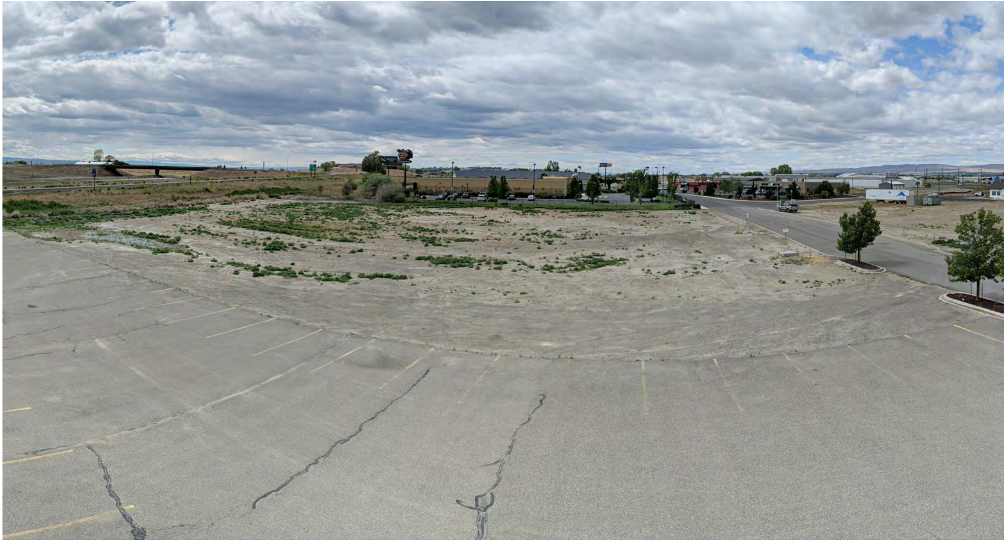
Looking West from Grand Cinemas Parking Lot