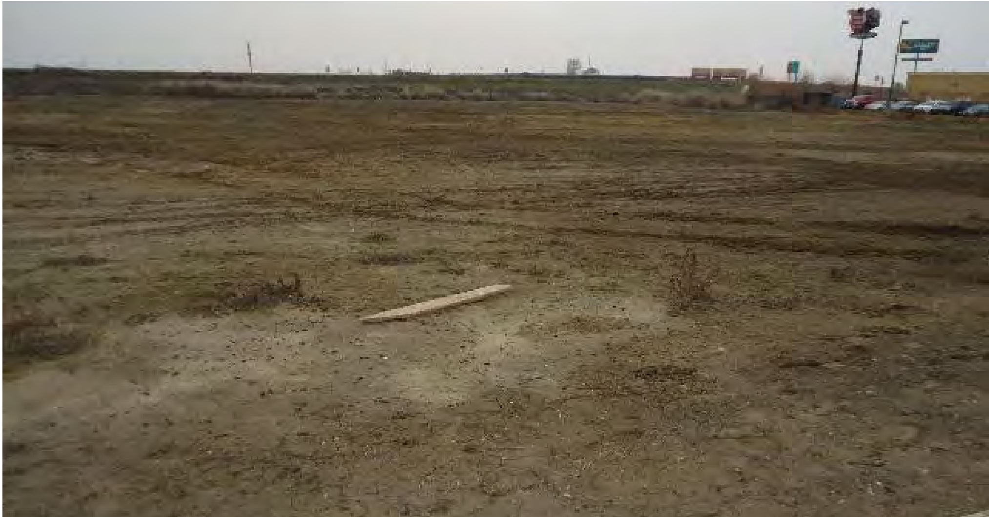
Looking Southwest from Picard Place